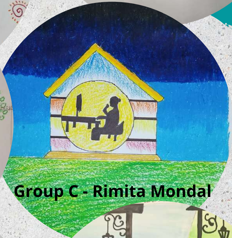
Group C - Rimita Mondal